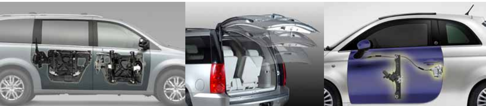
Left: Structural Plastic Door Module. Center: Outside the Seal Power Liftgate System. Right: Single Rail Window Regulator and Modular Side Door Latch.

Magna International Inc., through Magna Closures, is one of the world's leading suppliers of dynamic closure systems and modules to the global automotive industry. We have over 20 years of experience with product creation, design, engineering, testing and validation of closure modules and mechanisms and our capabilities are among the most diversified in the industry. Magna Closures is a leader in integration and program management with an extensive Innovation and Product Development process to meet our customers' needs. Our product expertise includes: door modules; window systems; power closure systems; latching systems; handle assemblies; driver controls; and obstacle detection.