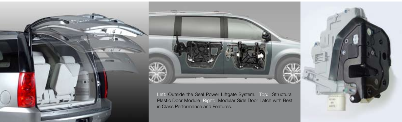
Left: Outside the Seal Power Liftgate System. Top: Structural Plastic Door Module Right: Modular Side Door Latch with Best in Class Performance and Features.

Magna International Inc., through Magna Closures, is one of the world's leading suppliers of dynamic closure systems and modules to the global automotive industry. We have over 20 years of experience with product creation, design, engineering, testing and validation of closure modules and mechanisms and our capabilities are among the most diversified in the industry. Magna Closures is a leader in integration and program management with an extensive Innovation and Product Development process to meet our customers' needs. Our product expertise includes: door modules; window systems; power closure systems; latching systems; handle assemblies; driver controls; and obstacle detection.